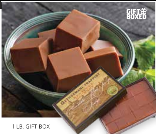
1 LB. GIFT BOX